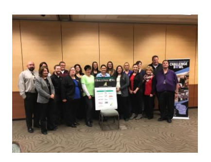
La Crosse/Coulee Tournament