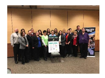
La Crosse/Coulee Tournament